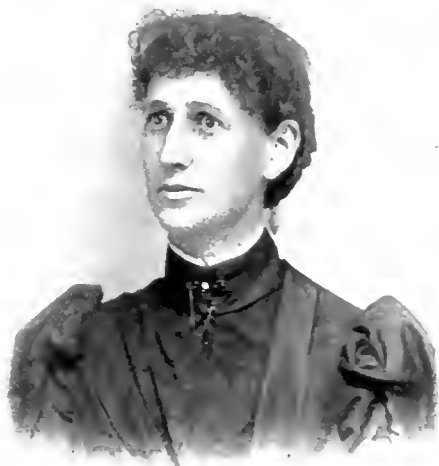
ROSE HARTWICK THORPE.